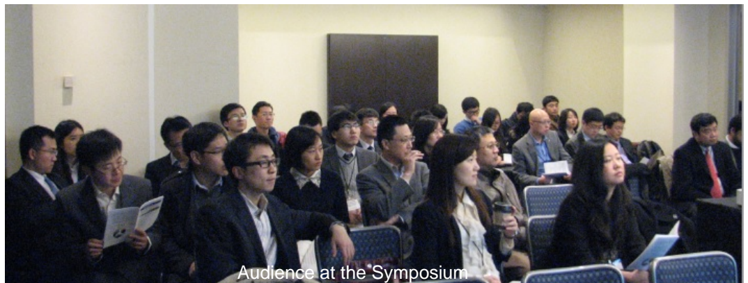
Audience at the Symposium

More than 100 transportation professionals attended the symposium. The presentations and the panel discussion were well received by the audience.