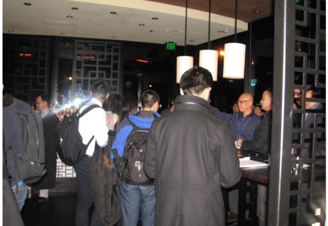
At the Reception