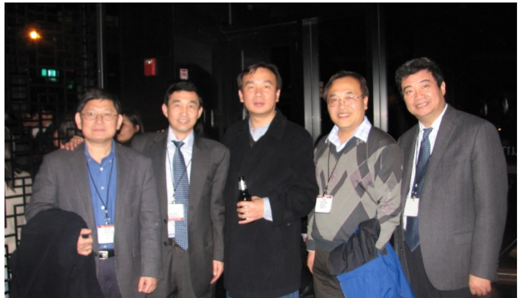
Transportation Professionals Attending the Reception